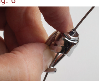
Hold down the push button and the hook can be adjusted freely up or down. Release the button and the hook grips firmly.

You can put more than one hook on a hanger, as long as the total weight of items to be hung does not exceed the specified limits (see chart in Getting Started section).