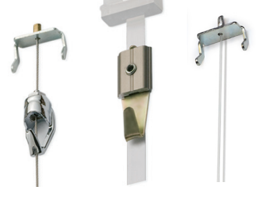
Hangers Steel Cable, Clear Tape, Clearline