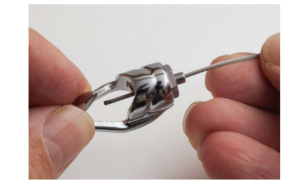
If you're using Push Button Hooks, fit the cable or Clearline into the top of the hook and feed it through.