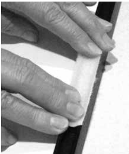
Figure 1 Attaching fastener strip to frame

Next, take the other side of the fastener, but do not peel off the paper backing —keep the adhesive on this side covered. Lay this strip onto the strip(s) placed in the previous step, sandwiching the hanging wire or tape in between ( Figure 2 ). This snugs the hanging wire or tape against the frame, effectively pulling your art back against the wall while allowing easy release when the piece needs adjustment.